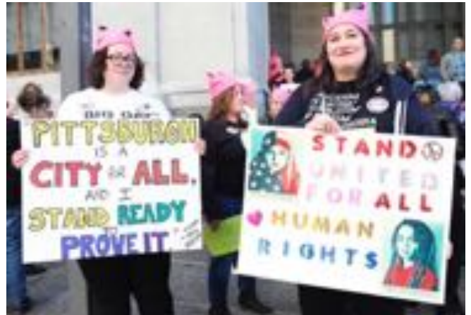
Photo at Pittsburgh March